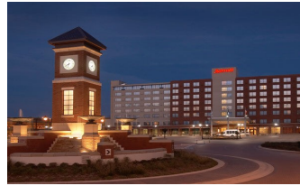
Marriott Coralville Hotel & Conference Center

Meeting will begin at 9:00 AM with registration taking